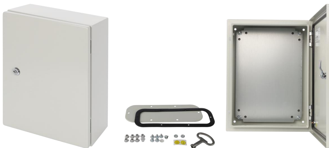
Fig. 1. View of enclosure.