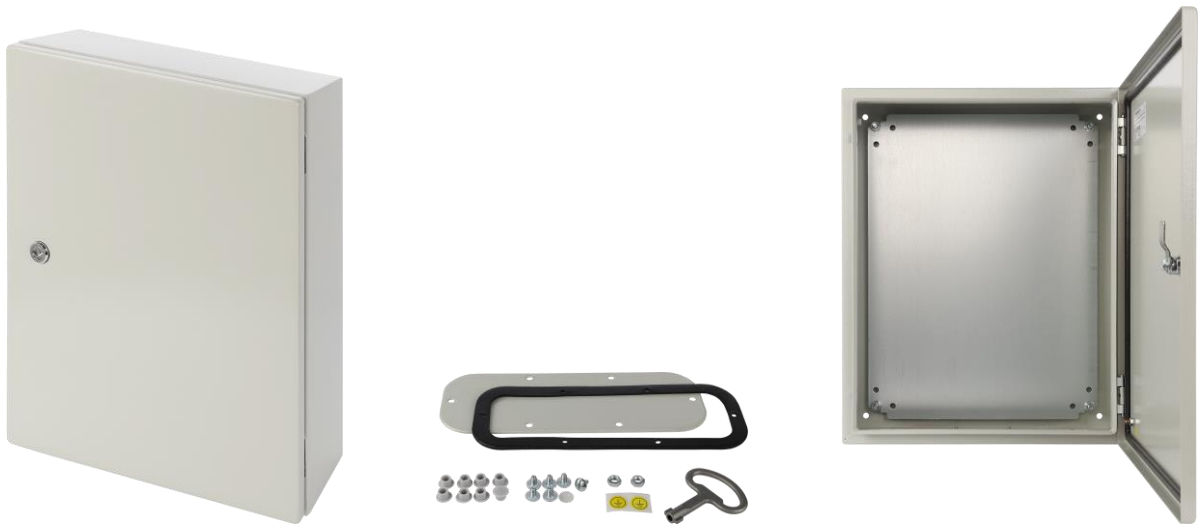
Fig. 1. View of enclosure.