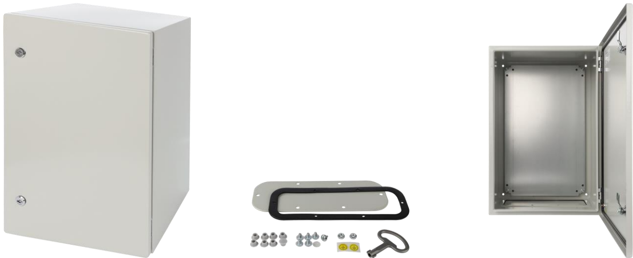
Fig. 1. View of enclosure.