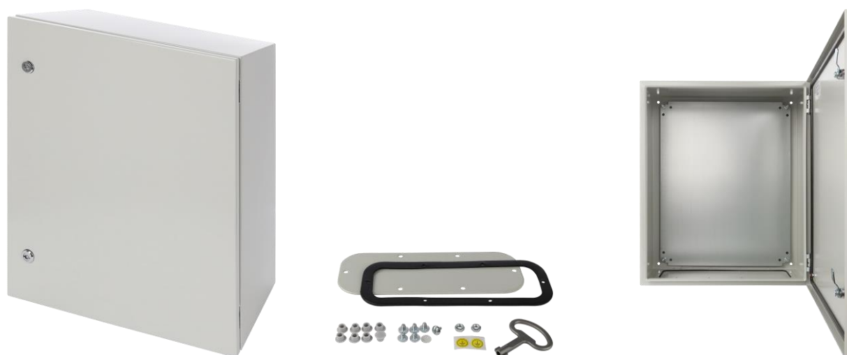
Fig. 1. View of enclosure.