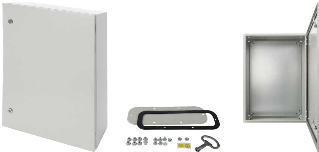
Fig. 1. View of enclosure.