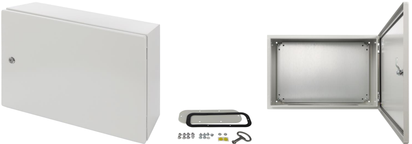
Fig. 1. View of enclosure.